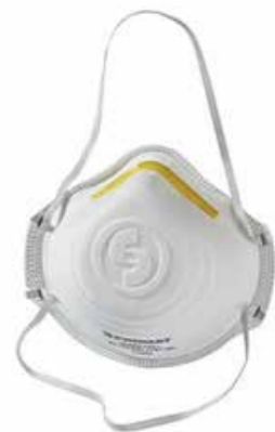
Stofmasker Snake FFP1