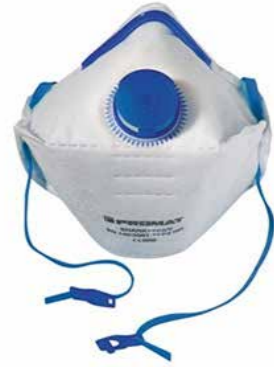
Stofmasker Shark · FFP2/V