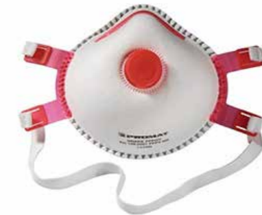
Stofmasker Snake · FFP3/V