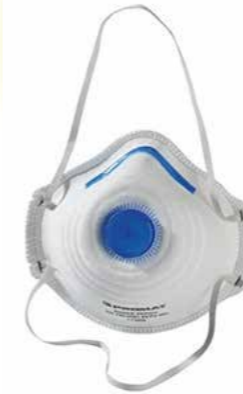
Stofmasker Snake · FFP2/V