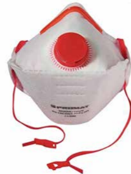
Stofmasker Shark · FFP3/V