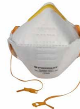
Stofmasker Shark · FFP1